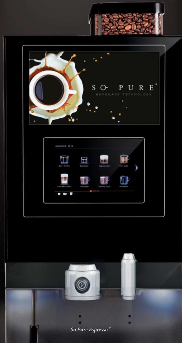
So Pure Espresso 7