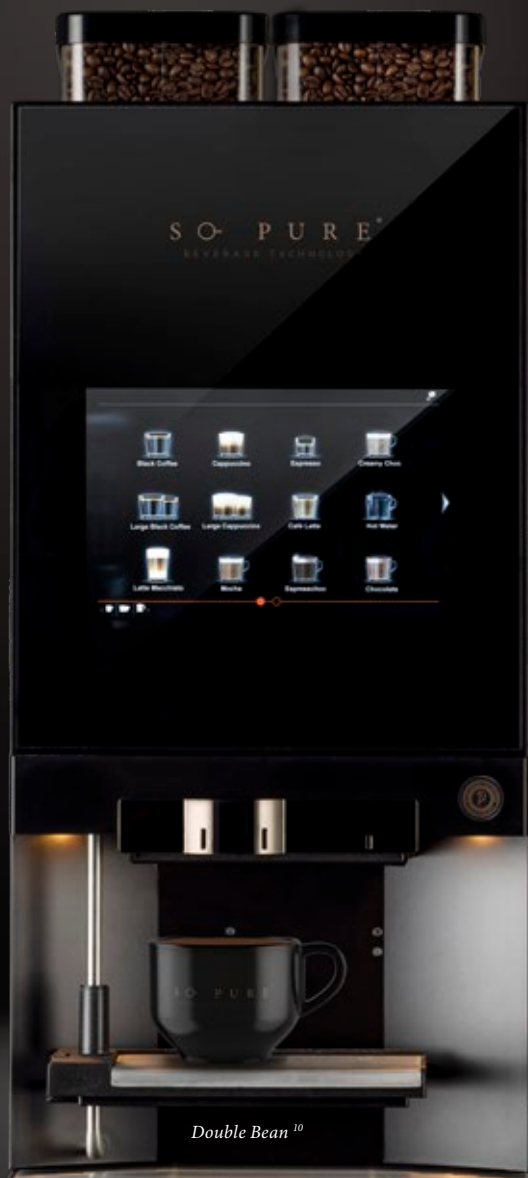
Double Bean 10