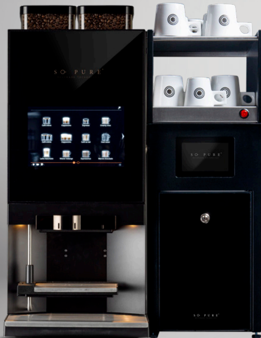
- Ivory Double Bean 10 -