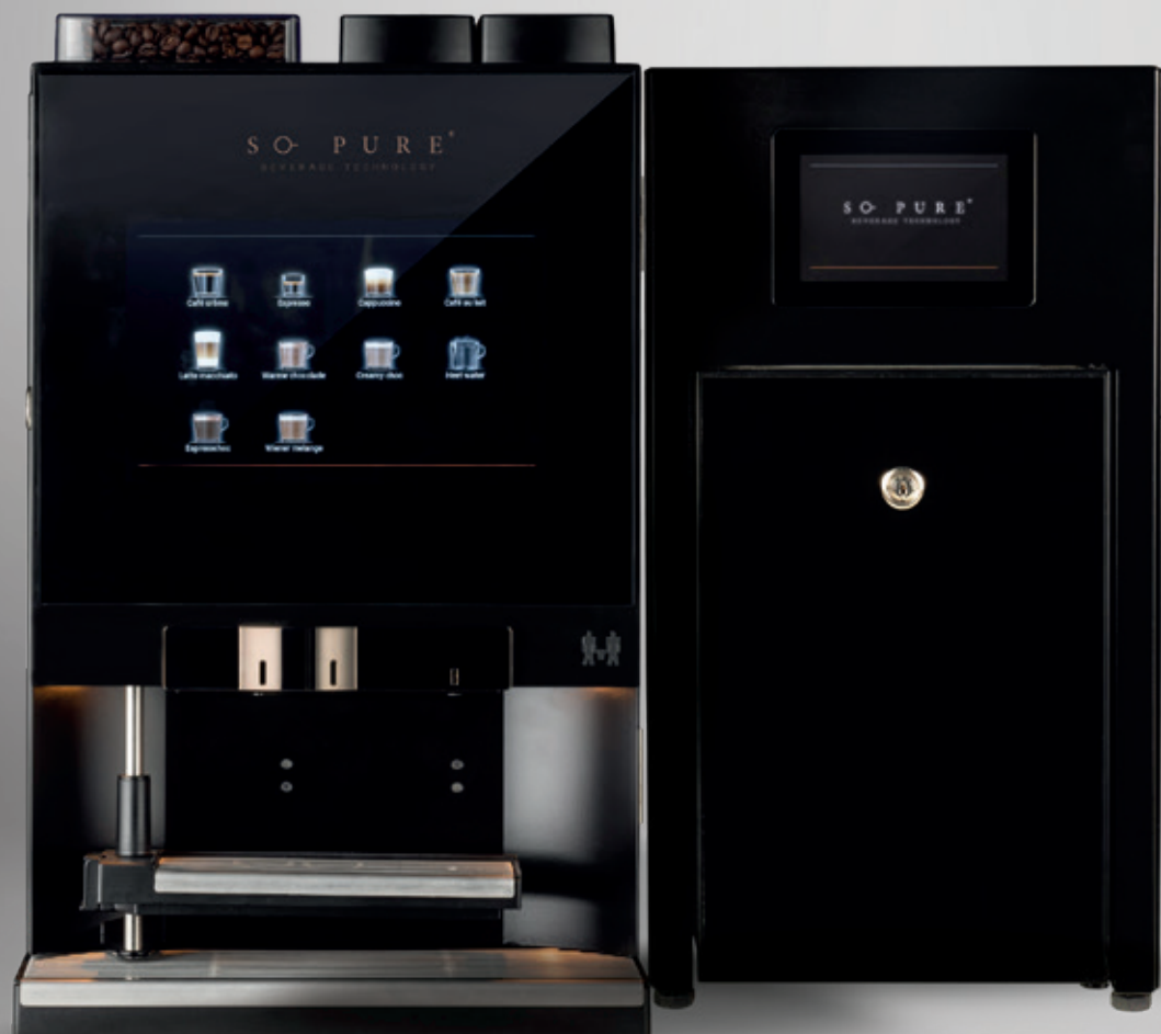
- Ivory Compact 10 -